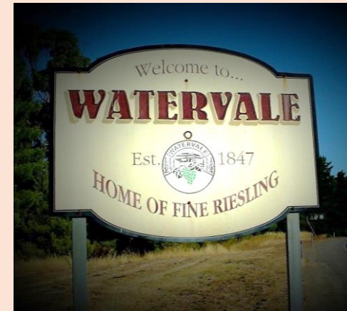
The village amongst the vines Est. 1847

We believe Watervale was settled in the early 1840's. Squatters had followed the noted young explorer John Ainsworth Horrocks who in 1839 had settled Penwortham, 3 miles north, the first European settlement north of Gawler.