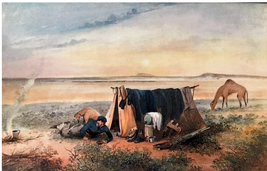
S.T. Gill....Invalid’s tent, salt lake 75 miles north-west of Mount Arden