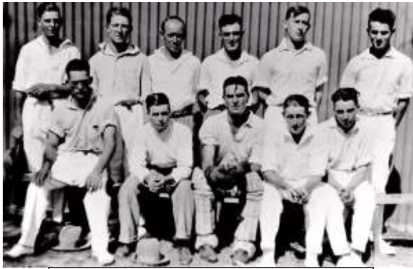
Watervale Cricket Club - 1925