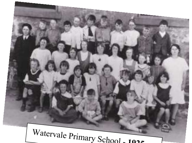
Watervale Primary School - 1925