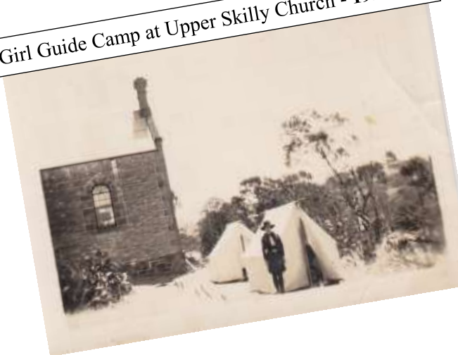
Girl Guide Camp at Upper Skilly Church - 1925