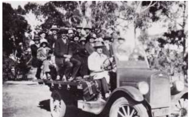
Penwortham Catholic Parishioners outing - 1925