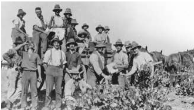
Grape Picking at Quelltaler Vineyard c.1925