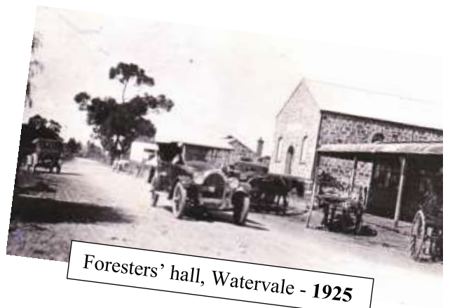
Foresters' hall, Watervale - 1925

Contact the Secretary for digital copies of photographs and any relevant names for a minimal cost.