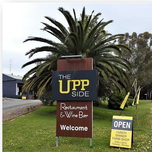
The Upside Restaurant and Wine Bar 7812 Horrocks Highway Penwortham

In 2021 a young entrepreneurial couple Christian and Caitlin Uphill bought the property and now run a successful restaurant called the Upside. They are slowly recreating the garden with produce that can be used in the restaurant which compliments their passion for paddock to plate philosophy.